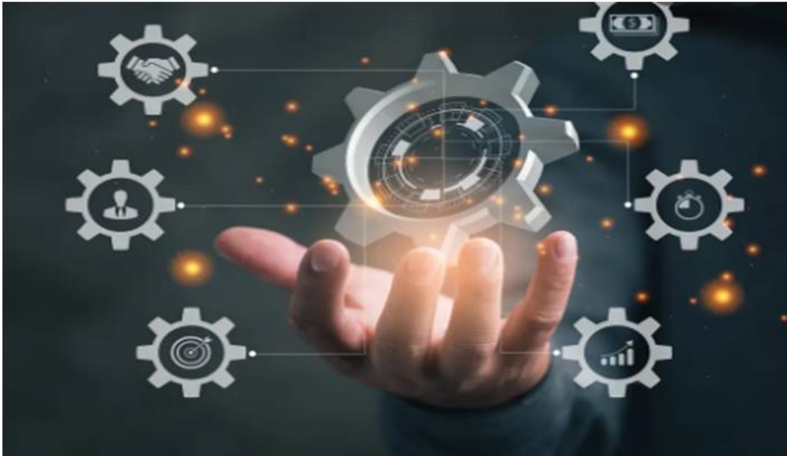
Figure-5: Automation and Linked Information Systems