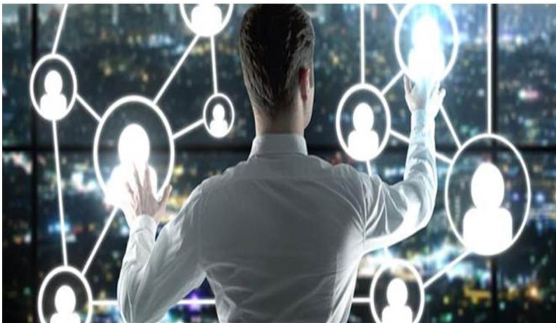
Figure-2: Online Network of Information Management Systems

COVID-19, in fact, resulted with several challenges to the information department in organization. The imposed challenges have a significant influence on the company's development tend. The world is attempting to invest in epidemic outcomes by utilizing information technology via the IT department (Office for National Statistics, 2020). The usage of modern information technology will result in a change from a predominantly office-based work environment to telecommuting system with predominately-remote work environment. Interconnected systems in information management in post epidemic era is expected to improve wonderful scenarios by utilizing information management pre-system tools to set up remote access, train, and provide endless-user assistance in an adequate environment (Bateson, 1979) (Figure 2).