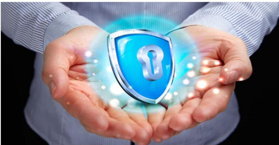
Figure-6: Balance Security with User Usability

A key challenge faced by IT departments during the transition to remote working has been usability (Lahaie, 2013). In many cases, the legacy systems that staff used in the office could not offer remote access, so more modern, accessible solutions were rolled out as rapid replacements. Some of these newer tools provide staff with much more intuitive and user-friendly systems, but some of them do not deliver adequate levels of security and compliance. Should IT departments remove the more usable but less secure systems as we move back to the office? Absolutely not! These tools have revolutionized the end-user experience, so removing them now would be a massively retrograde step (Figure 6).