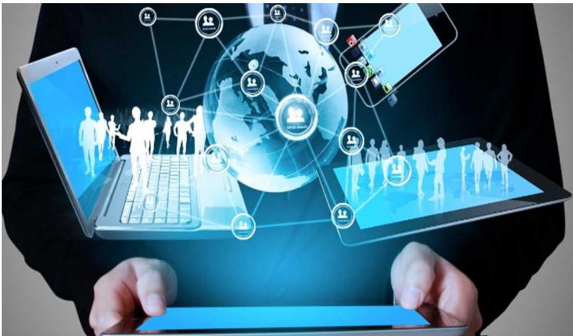
Figure-8: Innovation in Information Management