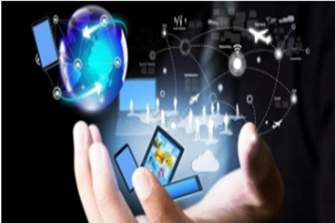
Figure-4: Information with Remote Access in Hand

Manual Information management systems used previously need must be replaced. The changes need incorporate a variety of information remote access goals (IT Governance Institute) (2007). In the post-pandemic workplace, organizations' information technology departments must build mobile phone-connected systems and internet-based telephones (Code Project, 2014). Companies need to develop a budget for remote access from this point forward. IT departments do not have the option to fall back to the in-house IT systems used before the pandemic, but this is a regressive course of action. Companies and organizations need a dynamic and hybrid workplace environment, with workers spending some time in the office and some working remotely, is the new normal. To deliver a seamless and effective end-user experience, organizations must provide remote-first tools for all aspects of business life.