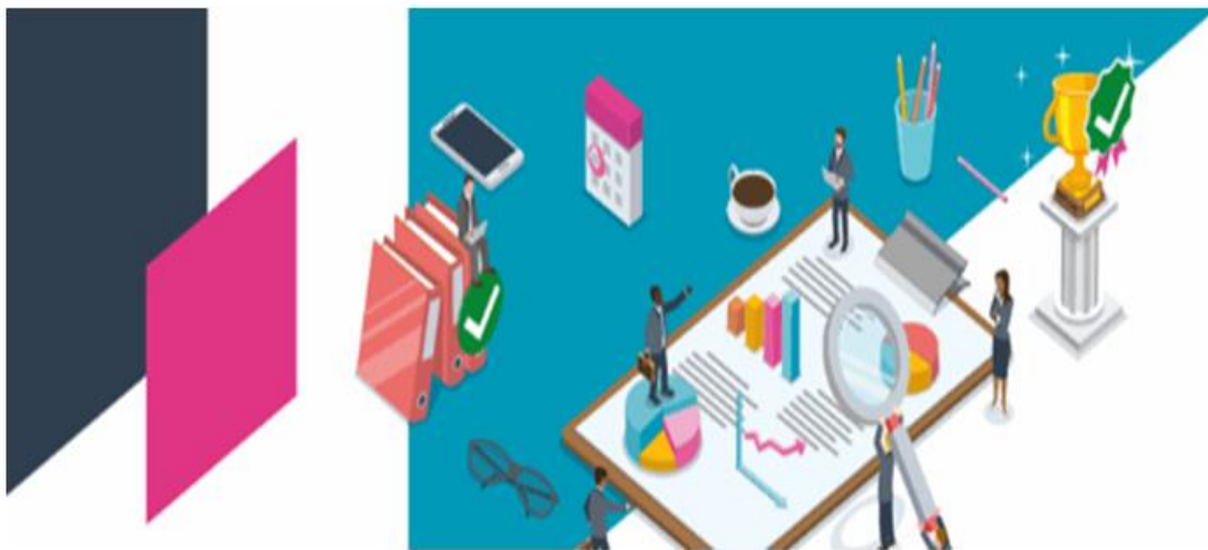
Figure-7: Information Systems Audit and Review

According to Levine (2008), organizations in IT departments are highly skilled at managing security. From firewalls to anti-virus tools, there are numerous ways to prevent malicious access and activities. However, few IT departments are as proactive when it comes to securing their information systems. In the days when all corporate information was stored within on-premises systems and accessed from the office, things were relatively simple. However, as discussed in the previous point, as the organization learns to balance usability with security, they need to take a more proactive stance on information governance and security (Figure 7).